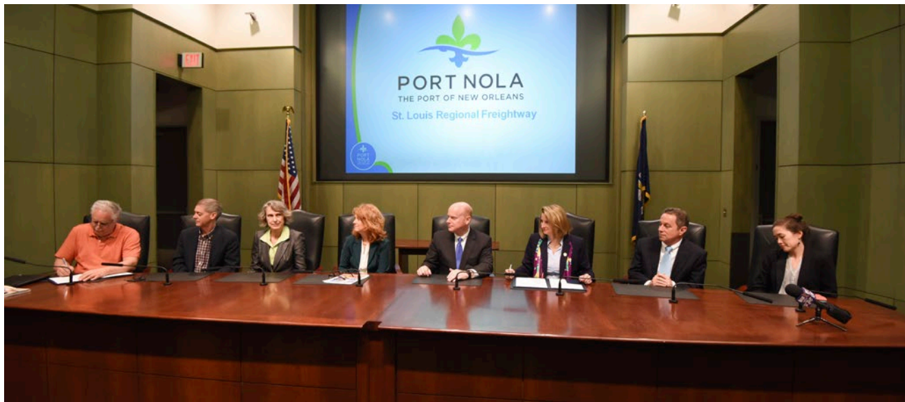
The Board of Commissioners of the Port of New Orleans and the St. Louis Regional Freightway sign a Memorandum of Understanding to exchange market and operational information. The goal is to expand trade and build upon existing and new business relationships between the two regions and critical ports.