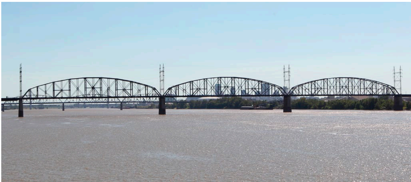
A project to replace the Merchants Bridge with one that can handle two modern freight trains simultaneously could create more than $456 million in economic activity over 20 years-nearly double the impact today, according to its owner, Terminal Railroad Association.