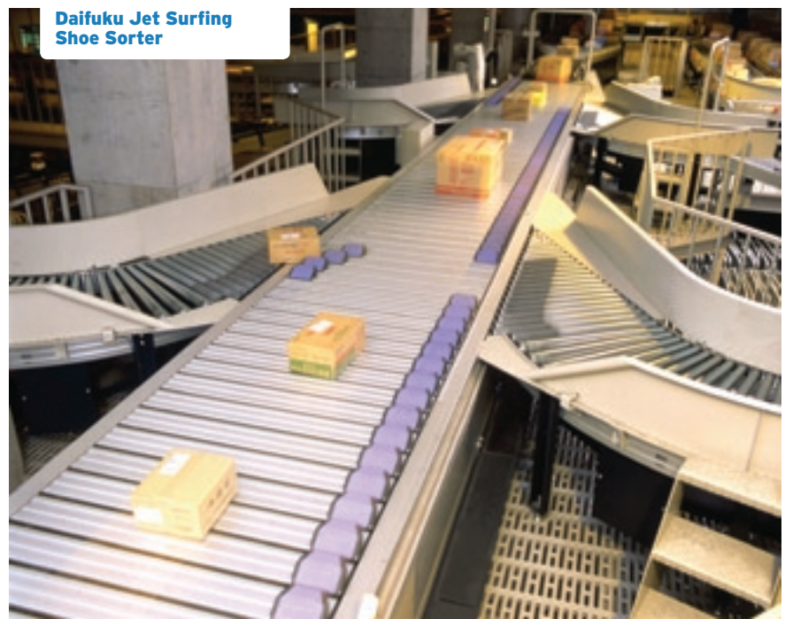
Daifuku Jet Surfing Shoe Sorter

FEATURES: Operates at speeds up to 541 feet per minute. Handles loads up to 110 pounds.