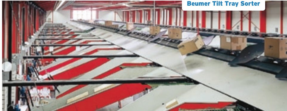
Beumer Tilt Tray Sorter

The HSTS can process items weighing up to 70 pounds at a rate of 230 feet per minute, with a total of 95