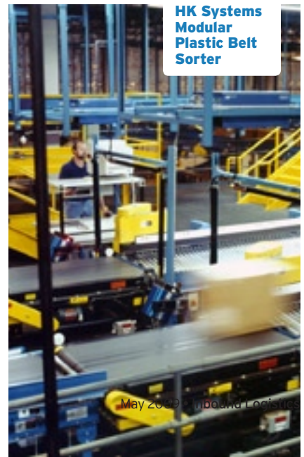
HK Systems Modular Plastic Belt Sorter

FEATURES: Available in four widths and with pushers located on both sides with staggered centers.