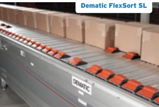
Dematic FlexSort SL

A new parallel divert mode minimizes gapping between packages, allowing higher throughput at lower speeds and reducing the tendency of small and square packages to roll during sortation.