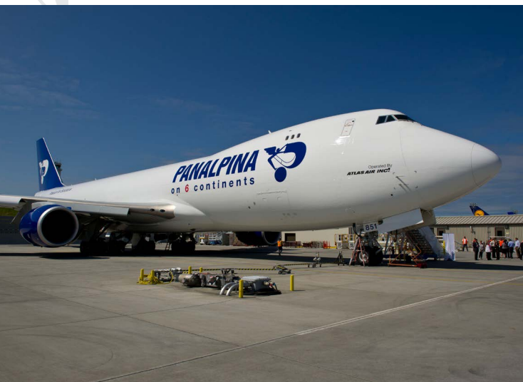
Traditional airfreight forwarders are boosting their capabilities based on changing shipper needs. Panalpina, for example, now offers paperless flights and temperature-controlled shipments, among other innovative services.

Moreover, while they make forwarding services more accessible online, few airfreight forwarding platforms actually transport goods or guarantee on-time delivery. “They offer an easier user interface,” Bailey says. “But, can this provide a sustainable advantage?”