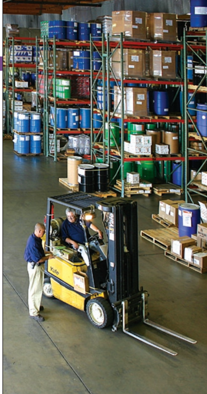
To cut overhead, many chemical companies are turning to 3PLs such as Weber Distribution to provide warehousing solutions.

Some chemical producers have turned to technology solutions such