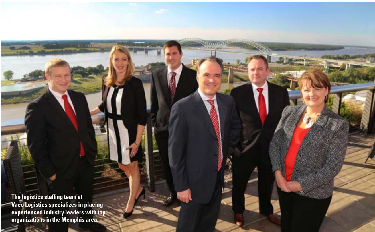
The logistics staffing team at Vaco Logistics specializes in placing experienced industry leaders with top organizations in the Memphis area.

helped establish Memphis International Airport as North America's busiest cargo airport.