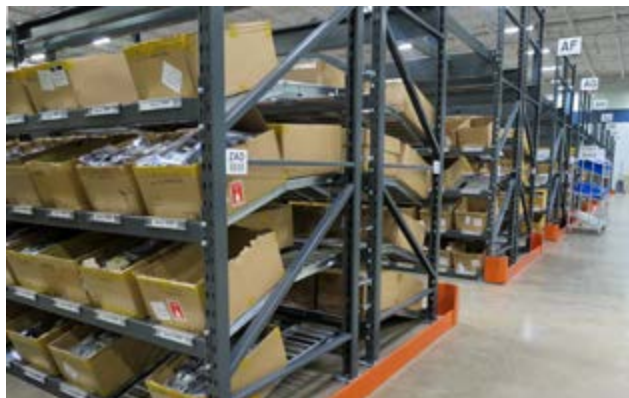
Mallory Alexander recently expanded its U.S. and Canada domestic capabilities, and operates a growing 4PL division. A state-of-the-art automated pick-and-pack operation is a new addition to its warehousing portfolio.