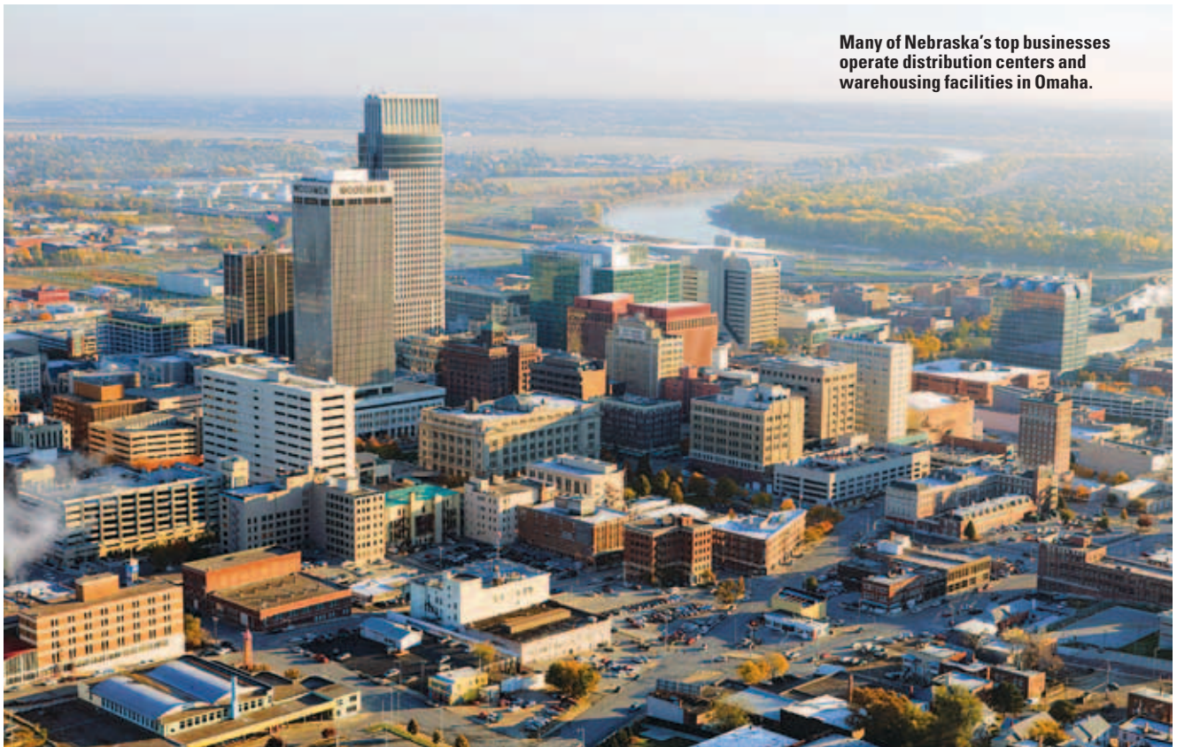
Many of Nebraska's top businesses operate distribution centers and warehousing facilities in Omaha.