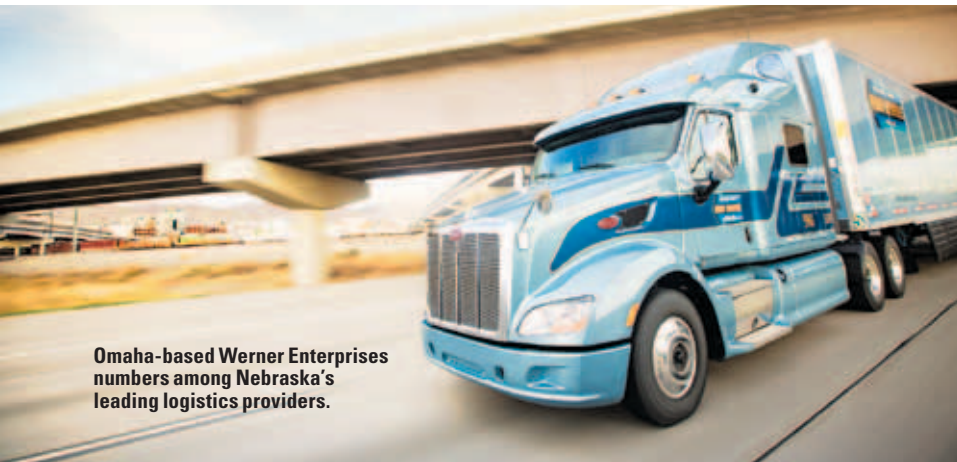
Omaha-based Werner Enterprises numbers among Nebraska's leading logistics providers.

increment financing, community development block grants, customized job training programs, and industrial revenue bonds.