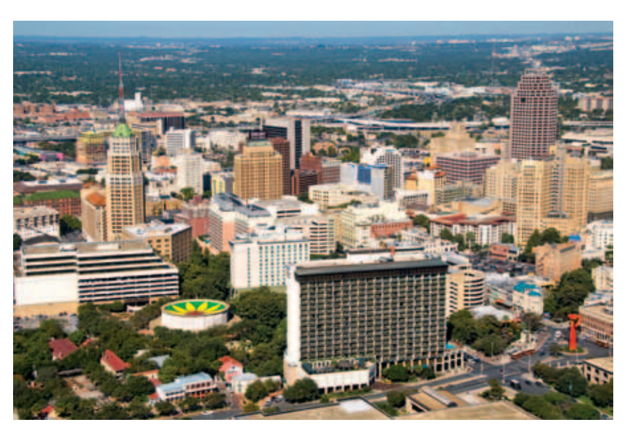
San Antonio is the seventh-largest city in the United States, and the second-largest within the state of Texas, with a population of approximately 1.3 million. It is also home to five Fortune 500 companies.

Until 2008, rail connectivity in San Antonio was not ideal. The two northsouth and east-west rail systems were not accessible from a single intermodal facility. Instead, Union Pacific operated its intermodal services out of two inner-city yards, requiring 80,000 semi trucks to pick up or drop off containers each year. Trains often had to bypass San Antonio and deliver containers to Houston; trucks then transported those shipments back to the San Antonio area