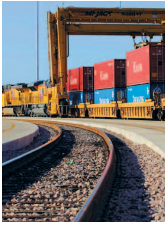
Union Pacific opened its $115-million San Antonio Intermodal Terminal in 2008, providing efficient and cost-effective transportation to the south Texas region.

Another key to the city's resurgence is Port San Antonio, a master-planned, 1,900-acre inland port offering a massive aerospace, industrial complex, and international logistics platform on the grounds of the former Kelly Air Force Base. The port lies entirely within a Free Trade Zone (FTZ), and provides access to the Kelly Field industrial airport; rail service via two Class I railroads, including Union Pacific; and quick transit time to Interstate Highways 10, 35, and 37.